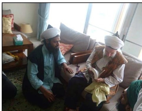
Sohba Collection 2016

Released at a special private gathering at Bukit Damansara, Kuala Lumpur, Malaysia.