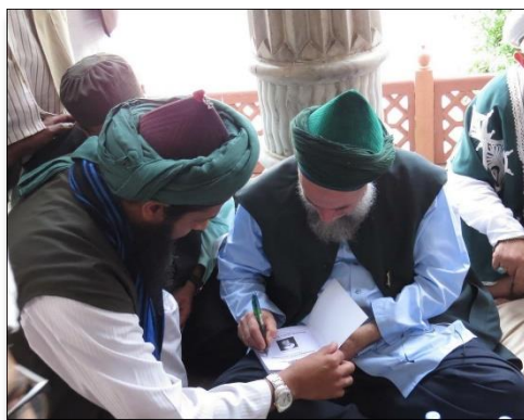
Sohba Collection 2015